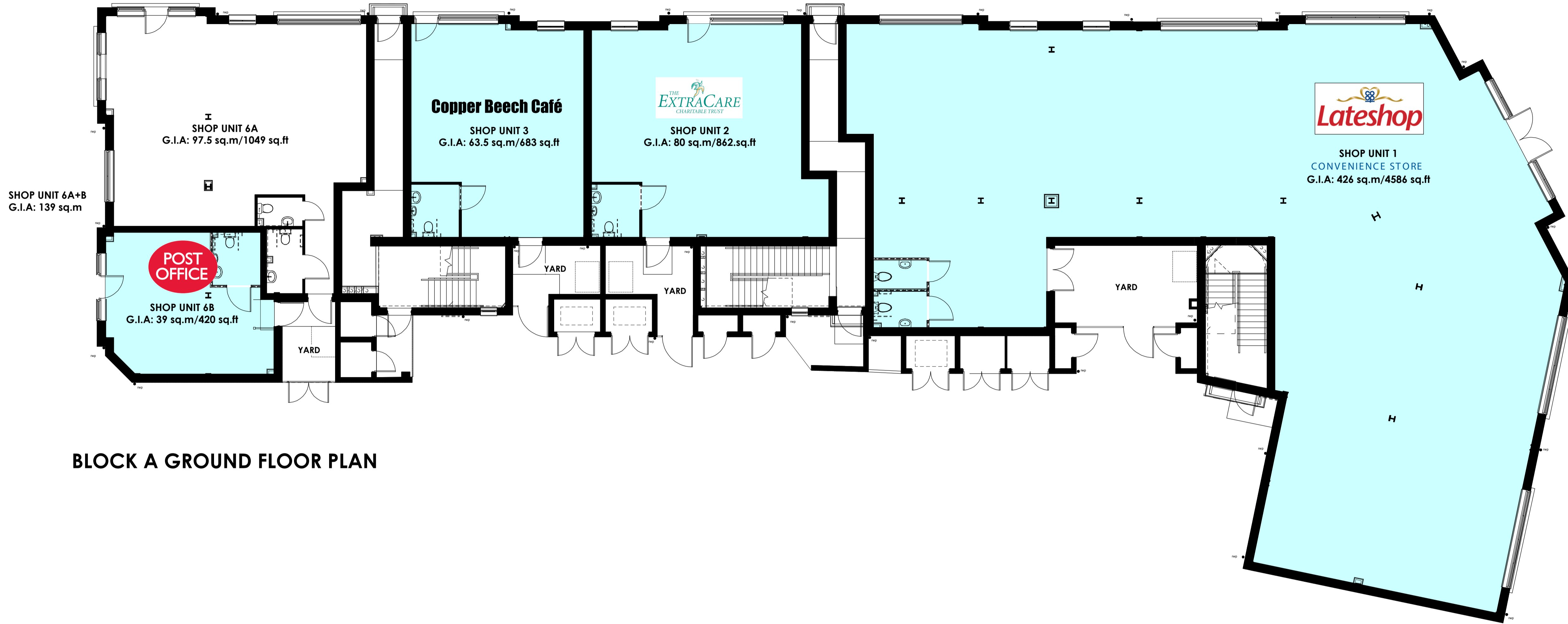
BLOCK A GROUND FLOOR PLAN

ALL SHOPFRONTS TO BE INSTALLED BY INCOMING TENANT AS PART OF FITOUT WORKS AND ARE SUBJECT TO PLANNING AND BUILDING REGULATION APPROVAL